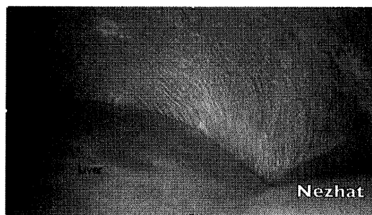
Figure 1. Evidence of endometriosis on abdominal aspect of diaphragm.

in 4 cases ( Figures 1 and 2 ). The chest wall was involved in 16 cases (64%) and the lung parenchyma in 10 cases (40%) ( Table 2 ). There was 1 case of bilateral lung and diaphragm endometriosis. A diaphragm resection was performed in 2 cases, and wedge resection of the lung parenchyma was performed in 5 cases. During traditional laparoscopy, fertility-sparing treatment of endometriosis was performed in 21 cases, a hysterectomy in 4 cases, and a bowel resection in 1 case. The pathology reports for all of the abdominopelvic tissue samples were consistent with endometriosis. The stage of endometriosis for each patient is shown in Table 1 . The 2 diaphragm pathology specimens showed endometriosis. In 1 patient the lung parenchyma wedge resections showed endometriosis in