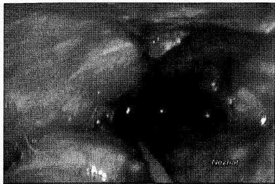
Figure 4. Extensive evidence of destruction of anatomy involving chest wall and parenchyma of lung.

suturing at the defect. Larger diaphragmatic perforations can be sutured, but the recurrence rate has been significant. If larger visceral diaphragm implants or defects are present, they may be approached via VATS because the liver bulk and limited subdiaphragmatic space may not allow complete resection. Our cohort shows that 76% of patients had involvement of both the diaphragmatic and pleural surface of the diaphragm, so it is important to evaluate both cavities if endometriosis is found on either side of the diaphragm.